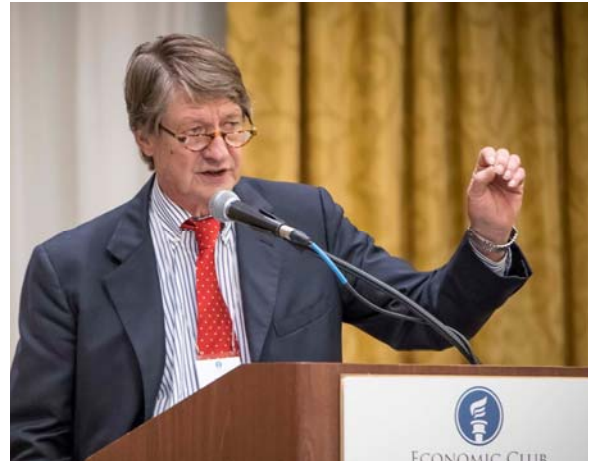
September 2017 speaker, PJ O'Rourke, political satirist and humorist.